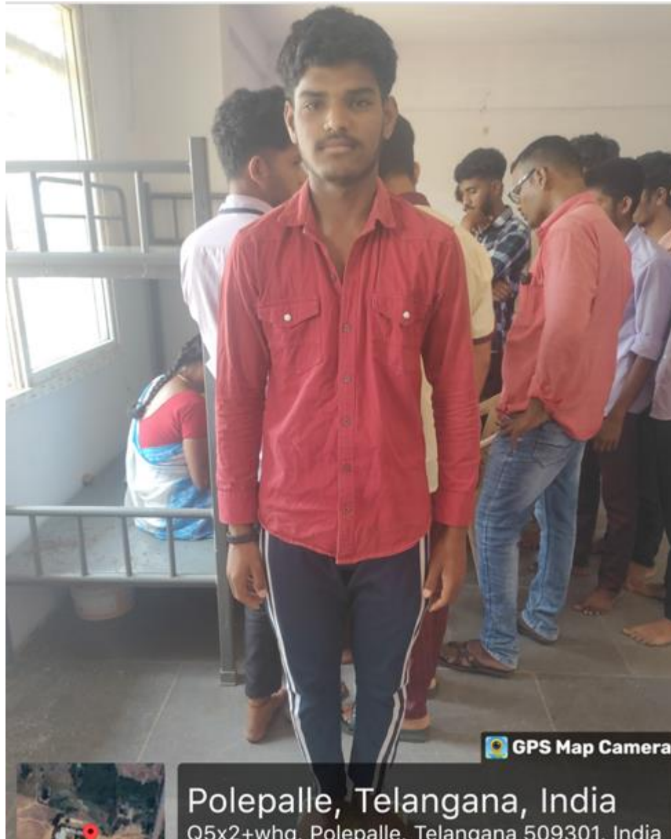
Photo: Measuring height of the student.