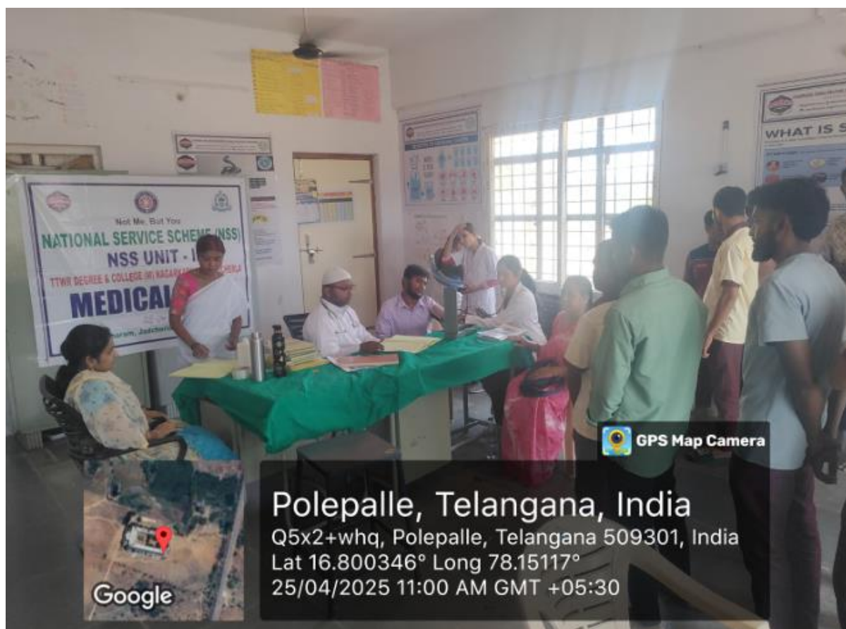
Photo: Checking BP of the student .

All students and staff members participated enthusiastically. Health reports were provided immediately after screening, and necessary advice was given to those requiring further medical attention.