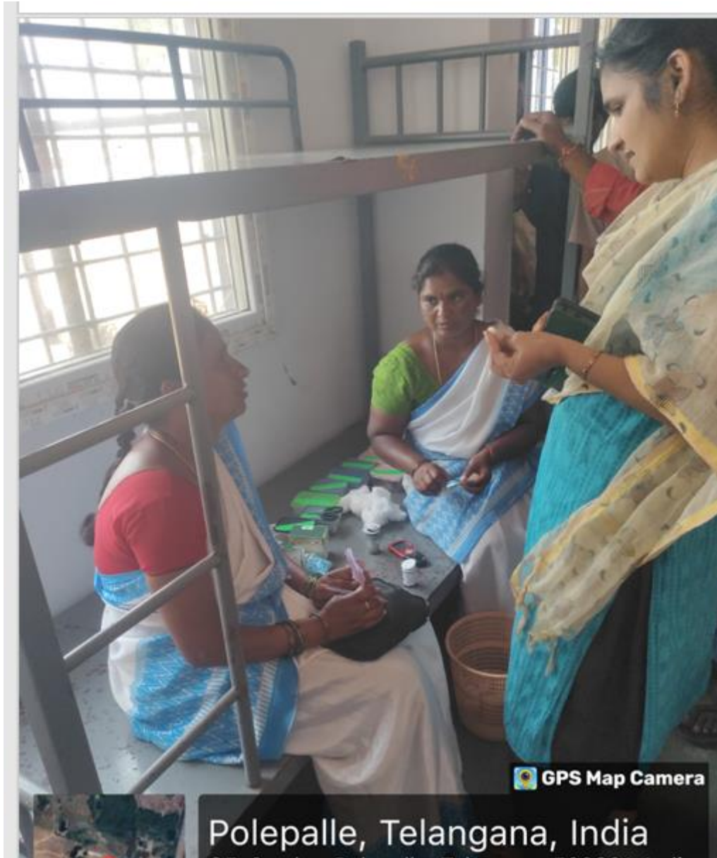
Photo: Checking HB test by the AshaWorkers.